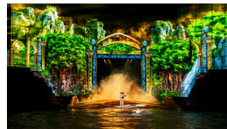
The House of Dancing Water